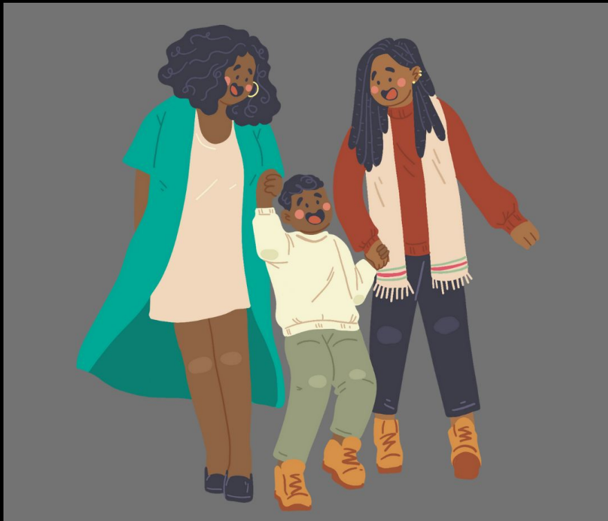
Image Description: An image of a Black queer family. In the image there are two adults, feminine presenting and one child. The two adults are holding the child's hands (the child is between them) and they are looking down on the child, smiling.