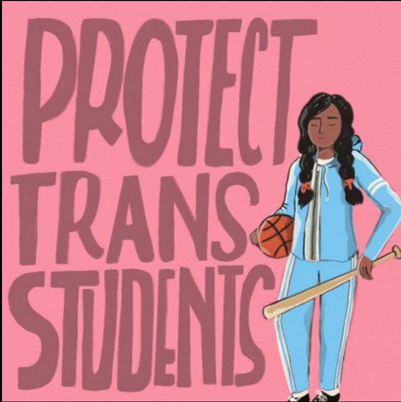
Image Description: A gif of a transgender girl wearing a blue track suit and holding a basketball and baseball bat. The gif contains the words "Protect Trans Students"