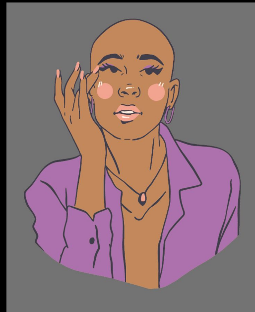
Image Description: An image of a bald individual with long eyelashes. They are wearing pink lipstick, blush and fingernails. They have on earrings and a necklace and a purple shirt that is open in the front.

Adapted from Sacramento City Unified School District’s “ Lesson Tuning Protocol ” document