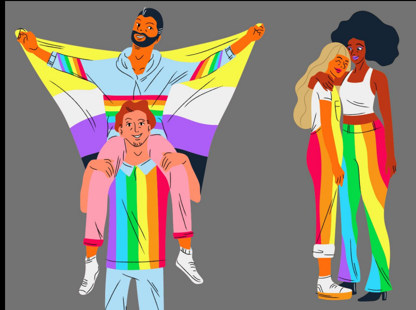
Image Description: On the left are two people, one sitting on top of the others shoulders. The person being held up has a moustache and beard and is wearing a hoodie with rainbow stripes and pink pants. They are holding a non-binary flag behind them, which looks like a cape. The one holding the other person is wearing jeans and a colored shirt with vertical rainbow stripes. On the right are two feminine presenting POC. One is wearing a halter top, rainbow pants, and black heels, the other has a rainbow pair of overalls on and white sneakers. They have their arms around one another.