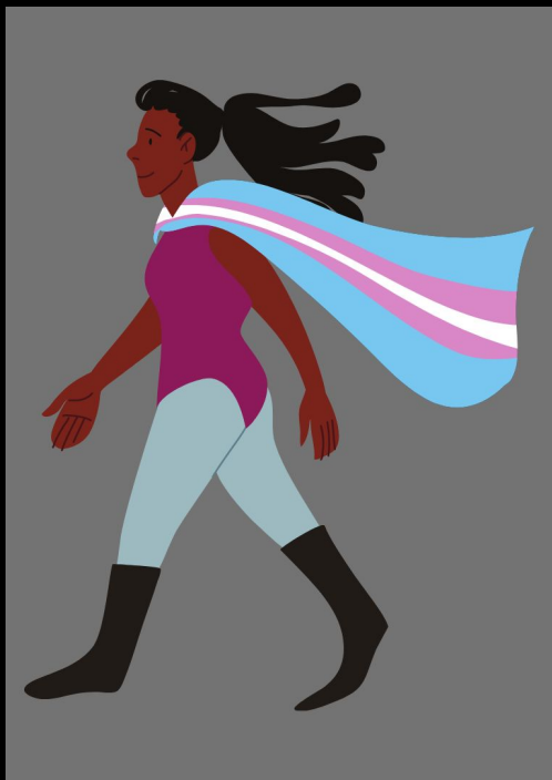
Image Description: An image of Black individual wearing a bodysuit with tights and black boots. They are wearing a transgender flag around their neck like a cape. The flag and their long hair (pulled back in a ponytail) is billowing out behind them as they walk.